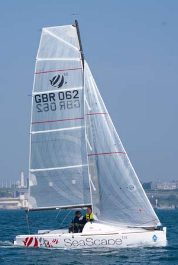
The square-top mainsail and carbon rig contribute to the Seascape's sporty image and performance