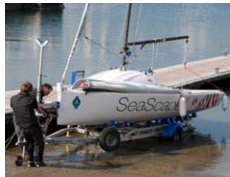
Launching is simple from the two-wheeled trailer