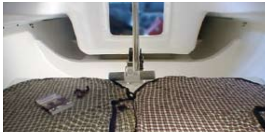
The cabin is a useful place to store the outboard, rudders and sails. It also provides two full-length berths

Seascape's pottering and cruising capabilities and several 'raid'-style events have taken place, especially in France where the boat is attracting a strong following. There are two full-length berths in the cabin – which can be closed off under sail with a neoprene cover instead of the glassfibre hatch – and the foot-chocks can easily be removed from the cockpit sole to create a wide flat sleeping area beneath a cockpit tent.