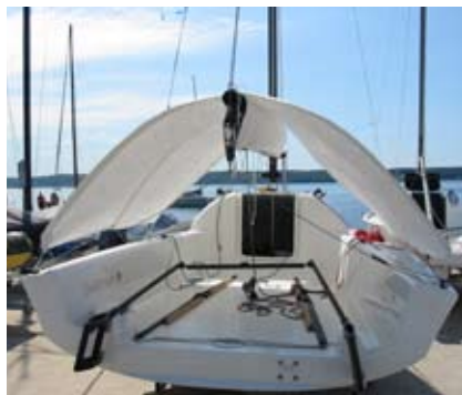
A boom tent can be used for camper-cruising